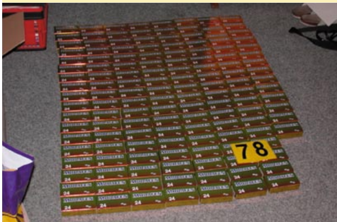
Figure 2. Seized packages of over-the-counter cold remedies containing pseudo-ephedrine used to manufacture methamphetamine in the Czech Republic (2007)

The synthesis of the precursors with other chemicals into the end-product methamphetamine is relatively simple. However, most methods involve flammable and corrosive chemicals and may therefore cause serious injuries and even death, while producing varying amounts of toxic waste that are often disposed of unsafely and may cause environmental damage (see box on page 17).