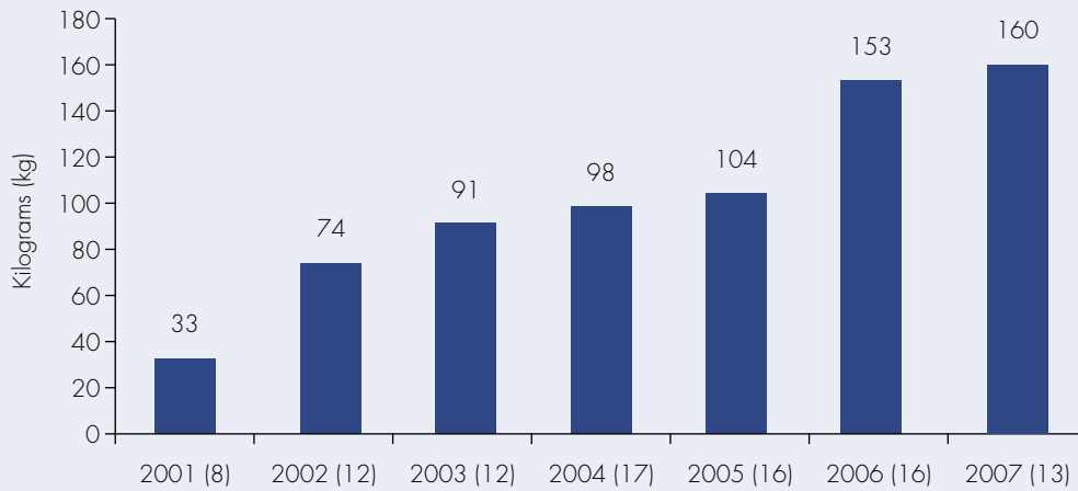
Figure 5. Trend in amounts of methamphetamine seized reported to the EMCDDA 2001–06 and Europol 2007

Note: The number in parentheses shown after each year is the number of countries reporting seizures above 0 grams.