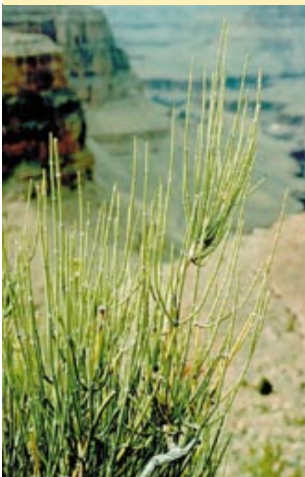
Figure 1. Ephedra vulgaris

In the 1920s and 1930s, the medical and paramedical use of methamphetamine and amphetamine (Benzedrine, Dexedrine) increased in Europe and in the West in general. For instance, amphetamine was prescribed for depression and other mood disorders in the United Kingdom, but was also sought out for its stimulant effects (by students, for instance). Problematic side effects of chronic and non-medical use of amphetamine, including hypertension, depression, dependence, and psychiatric disturbances have been documented since the late 1930s (ACMD, 2005). Nevertheless, both amphetamine and methamphetamine enjoyed widespread acceptance as safe and beneficial drugs among the medical profession and the public at large, well into the 1960s.