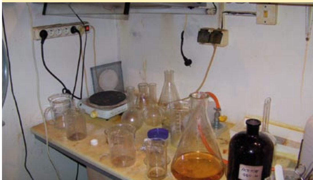
Figure 3. Small-scale methamphetamine production facility set in a garage, Czech Republic (2007)

However, compared to production in east and south-east Asia, North America and Oceania, much of which is done in large manufacturing facilities, the production of methamphetamine in the Czech Republic is small-scale. Most of it appears to be carried out in so-called 'kitchen labs' (see Figure 3) operated by 'cooperatives' or 'squads' of users for their own consumption (Zábranský, 2007), and they obtain the precursors, especially pseudo-ephedrine, from cold remedies sold without prescription in pharmacies (2) .